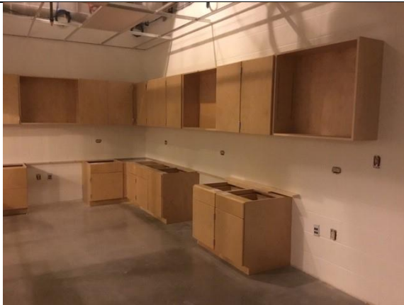
Millwork is being installed in humidity controlled spaces.