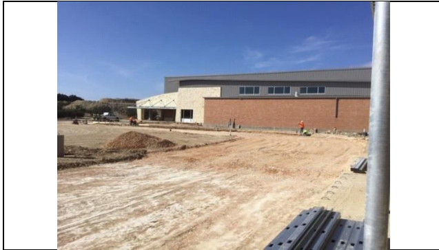
Site work is in progress