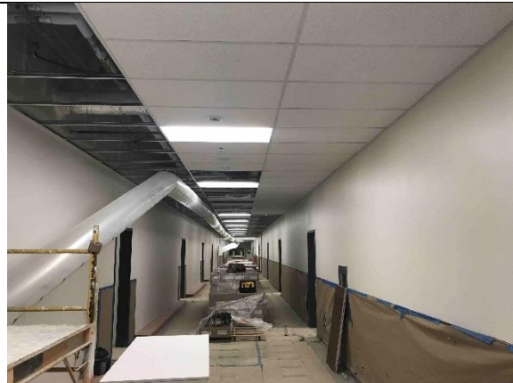
Classroom Corridor has humidity control. Suspended acoustical ceilings are being installed.