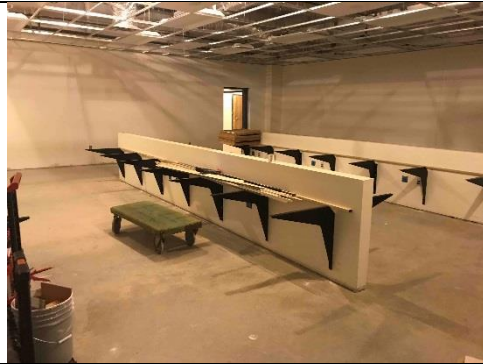
Computer Lab counters being installed