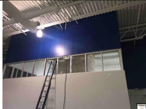
Library interior work in progress