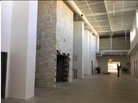
Elevator access at Administration level